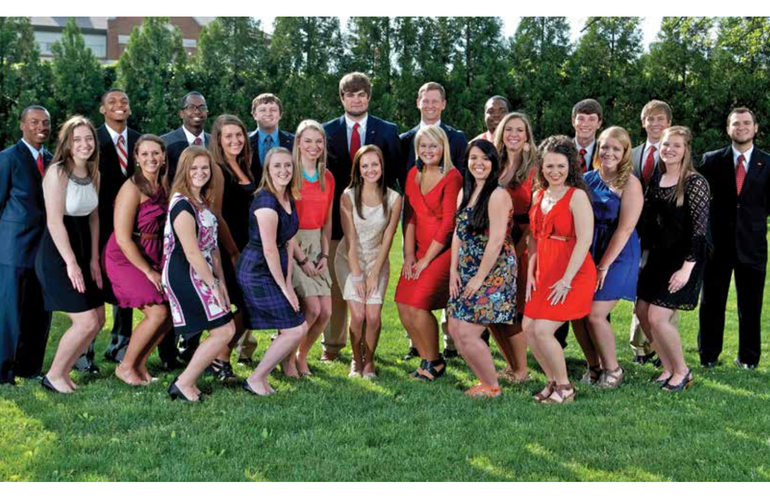
The 2012 JSU Ambassadors; students who serve as official representatives of JSU and assist in on-campus recruiting events.