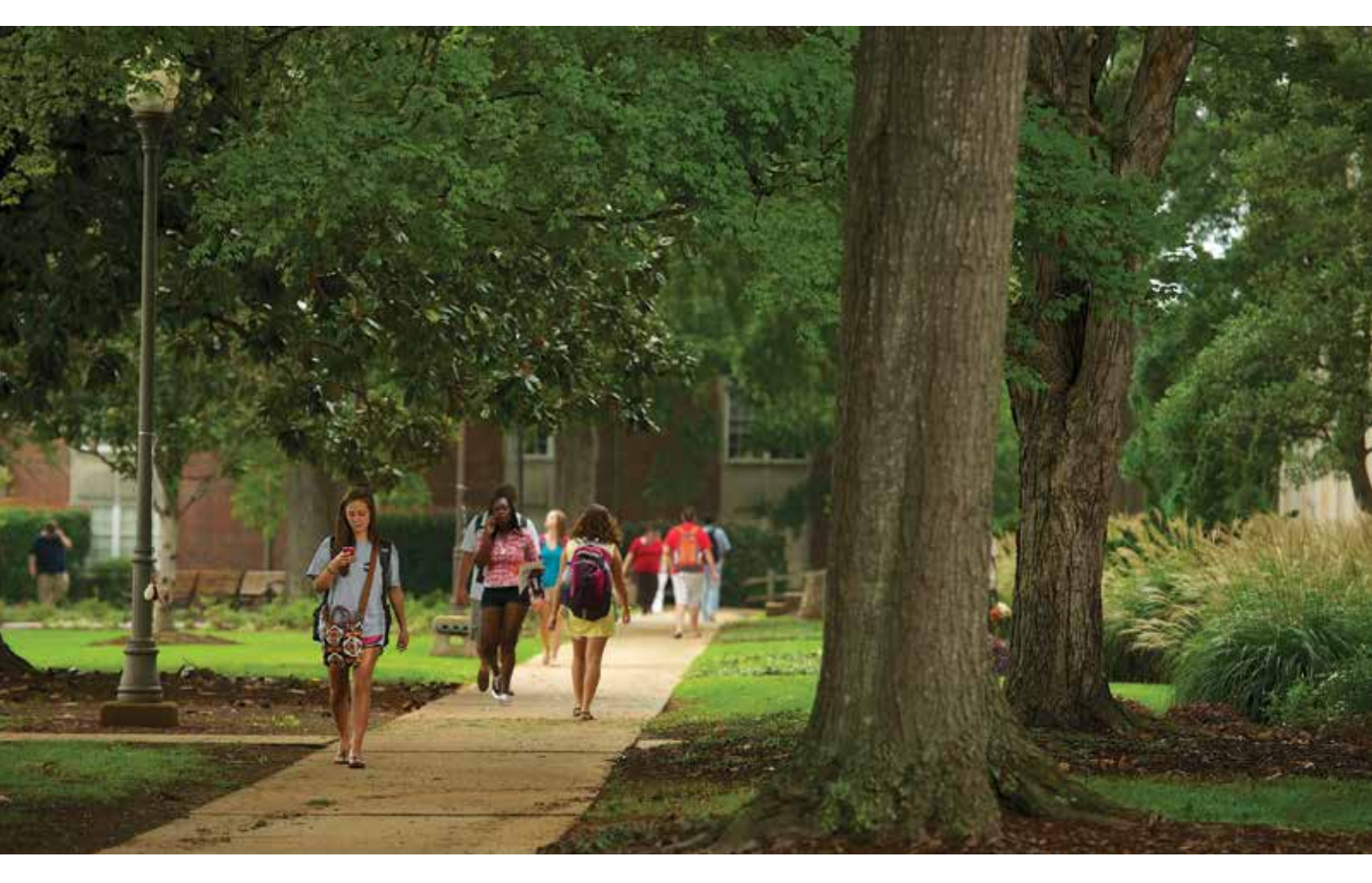
Students changing classes walking through the Quad of Jacksonville State University.