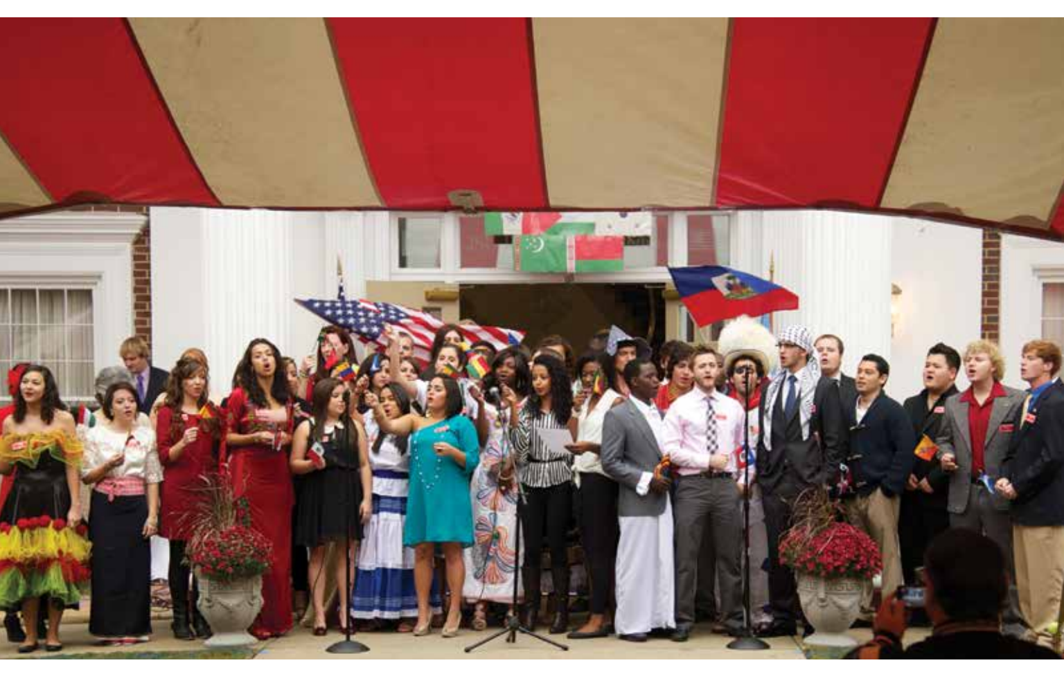
The JSU International House observes the annual UN Day Tea. Colorful national clothing, songs and dance are presented by the students.