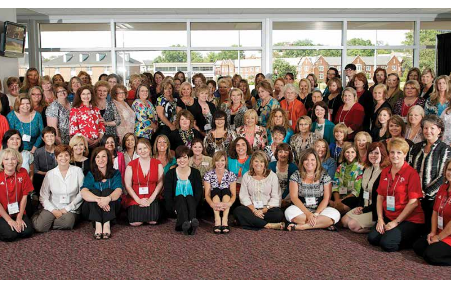
The First Annual Administrative Professionals Conference was held to recognize, encourage, and inspire, the 100+ attendees.